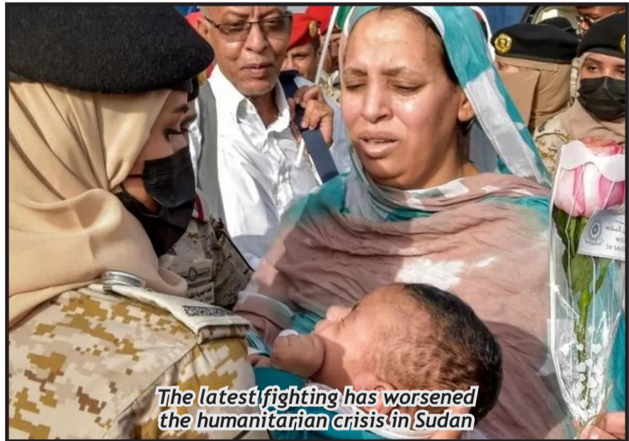
The latest fighting has worsened the humanitarian crisis in Sudan