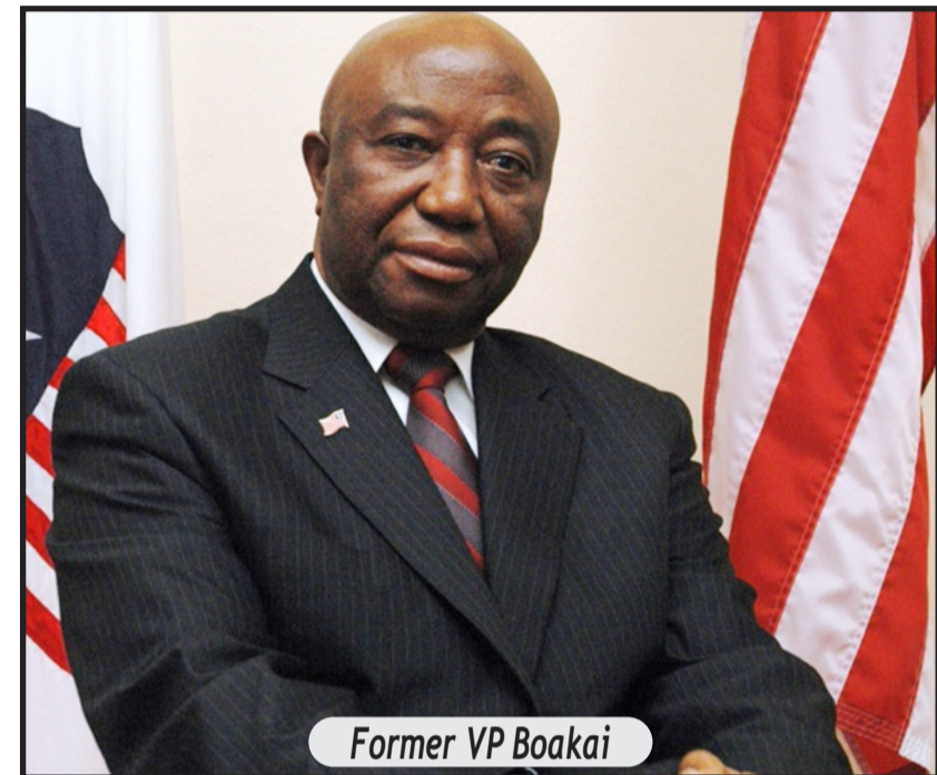
Former VP Boakai

He alleged that the ruling Coalition for Democracy Change (CDC) is currently worried and trembling because it is seeing that the opposition is getting ready to take over the country.