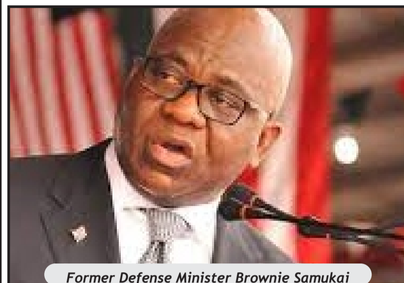
Former Defense Minister Brownie Samukai

L'ancien ministre libérien de la Défense, Brownie Samukai, a lancé un appel aux alliés de Joseph Nyumah Boakai qui se disent désenchantés de faire preuve de maturité politique et de ne pas tout gâcher.