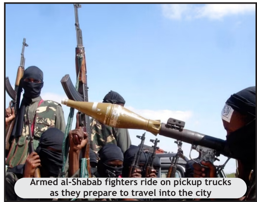
Armed al-Shabab fighters ride on pickup trucks as they prepare to travel into the city

Somalia is also depending on troops from Djibouti, Ethiopia and Kenya after the neighboring countries in January agreed to jointly launch military operations against al-Shabab strongholds. VOA