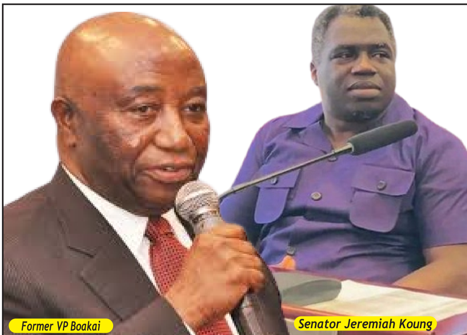
Former VP Boakai