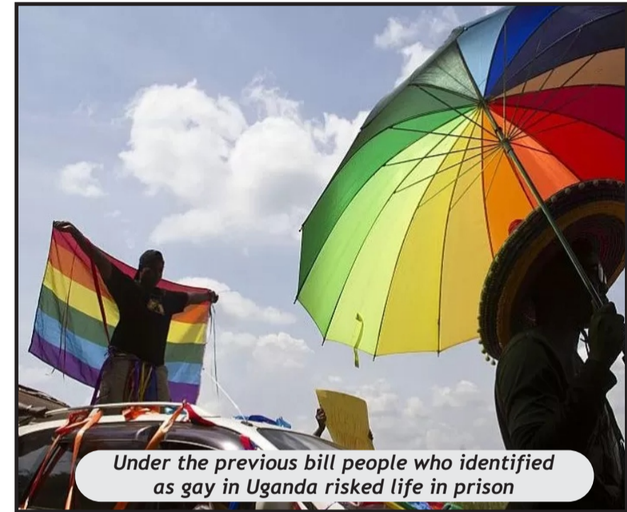
Under the previous bill people who identified as gay in Uganda risked life in prison

"Several of these projects are unexpectedly coded as support for women's rights and say they are focused on gender equality," said researchers for the the Institute for Journalism and Social Change. BBC