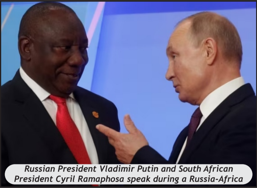
Russian President Vladimir Putin and South African President Cyril Ramaphosa speak during a Russia-Africa