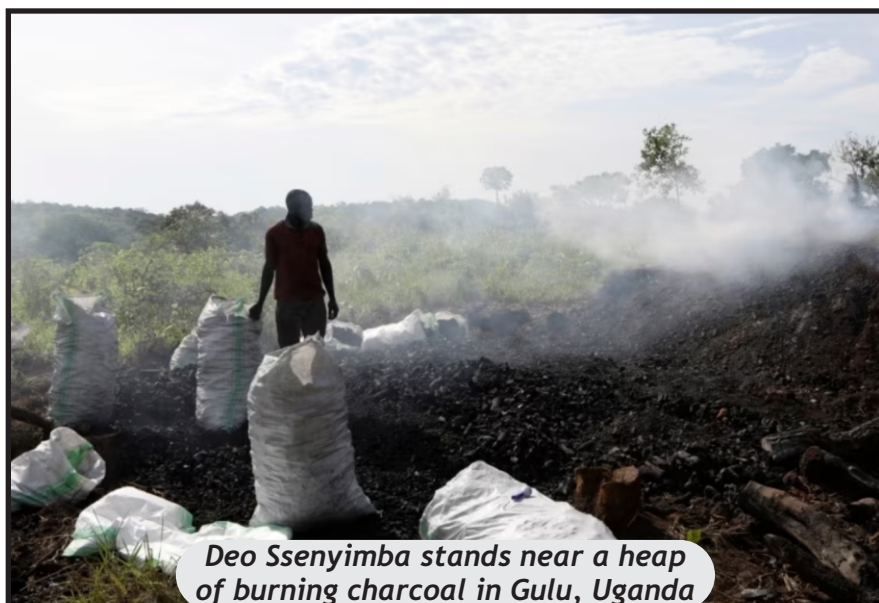
Deo Ssenyimba stands near a heap of burning charcoal in Gulu, Uganda

remains lush but sparsely populated and impoverished, attracting investors who desire the land mostly for its potential to sustain the charcoal business. And demand is assured: Charcoal accounts for up to 90% of Africa's primary energy consumption needs, according to a 2018 report by the U.N. Food and Agriculture Organization. VOA