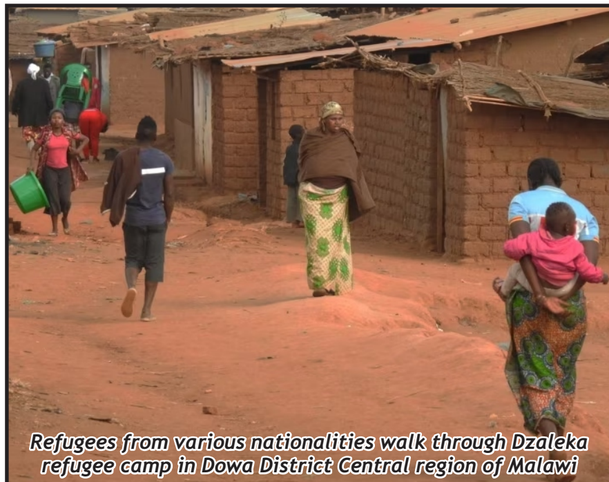
Refugees from various nationalities walk through Dzaleka refugee camp in Dowa District Central region of Malawi

"But we have a working relationship with different countries especially our neighbors [and] that includes Rwanda, Burundi, just as we do with Zambia,