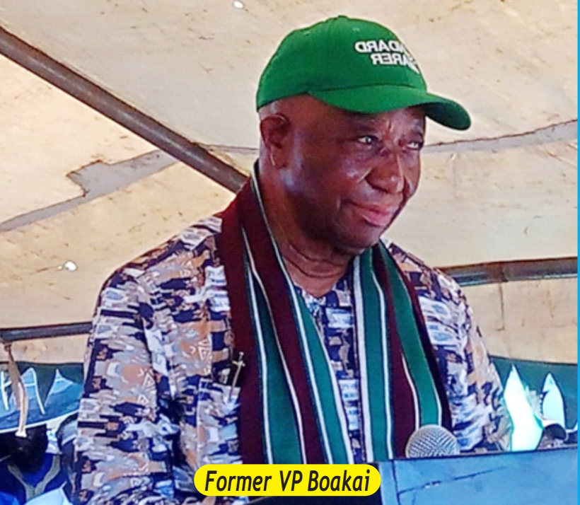
Former VP Boakai

"You used to go to the restaurant and eat chicken. But today, they are bringing chicken feet. You don't know where the chicken is from but only the feet you can see. All of those things will be things