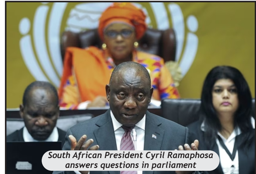
South African President Cyril Ramaphosa answers questions in parliament

"I think it might be a way for South Africa to distract from the 'Lady R' scandal, about South Africa allegedly arming Russia on a ship that was loaded at night in secret, and the other flak that South Africa has been getting, but I do think it's coming from a genuine place of wanting to make a difference," said Gruzd. Russian President Vladimir Putin has welcomed the African leaders' mission, as has Ukraine. But in an online news conference last week, Ukrainian Foreign Minister Dmytro Kuleba warned that some things are non-negotiable. VOA