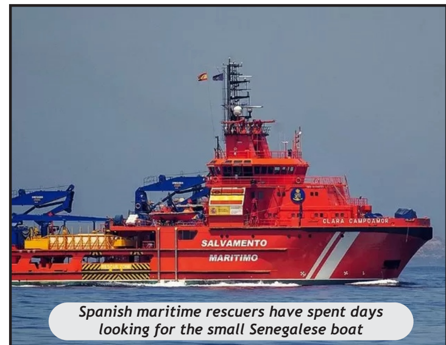
Spanish maritime rescuers have spent days looking for the small Senegalese boat

"Despite the year-to-year decrease, flows along this dangerous route since 2020 remain high compared to prior years," the IOM says. BBC