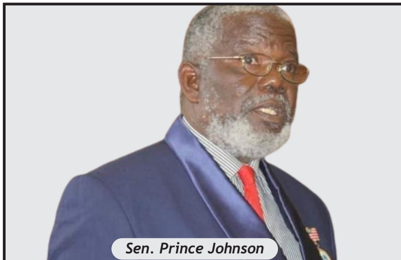
Sen. Prince Johnson