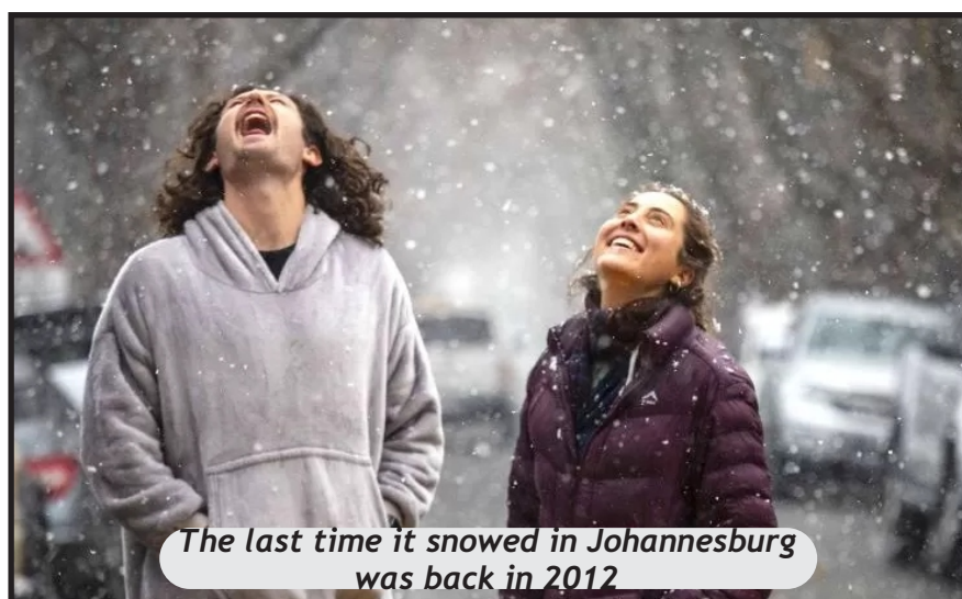
The last time it snowed in Johannesburg was back in 2012

Eastern Cape to be extra vigilant over the next week as they keep watch over hundreds of teenage boys undergoing traditional circumcision rites on isolated mountainsides across the province, a practice seen as a rite of passage into manhood amongst the Xhosa ethnic group. Farmers are also being advised to provide shelter for their livestock during the cold spell. It is not clear what role climate change has played in the rare snowfall. BBC