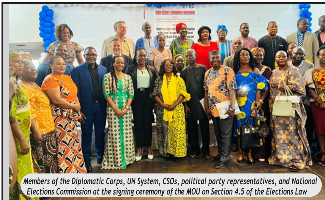
Members of the Diplomatic Corps, UN System, CSOs, political party representatives, and National Elections Commission at the signing ceremony of the MOU on Section 4.5 of the Elections Law

Liberia also had an opportunity in 2022 and 2023 to pass an electoral reform bill which included a minimum 30% gender quota. This would have required political parties to include no less than 30% of either gender on their candidate nomination lists for the 2023 elections.