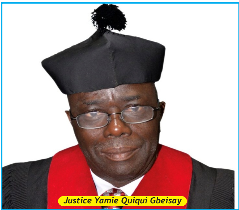
Justice Yamie Quiqui Gbeisay

prosecutors came a day after the deadline (July 5, 2023) given to them to produce all pieces of evidence against the defendants expired.