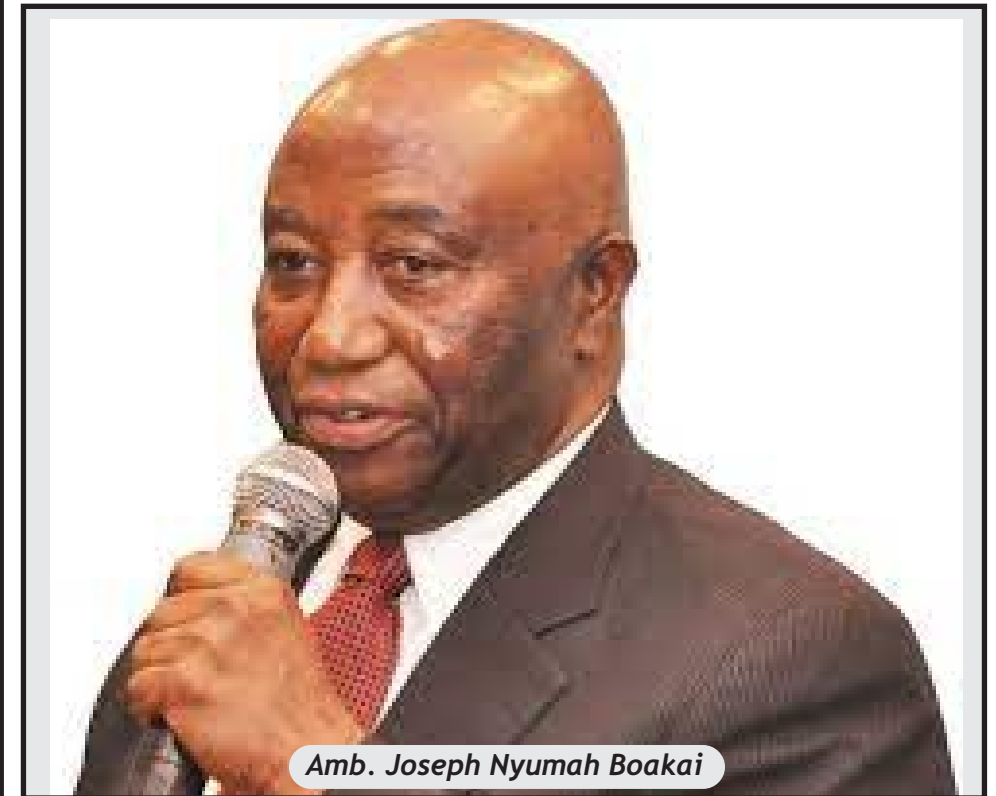
Amb. Joseph Nyumah Boakai

He said it demonstrated their love, and he was