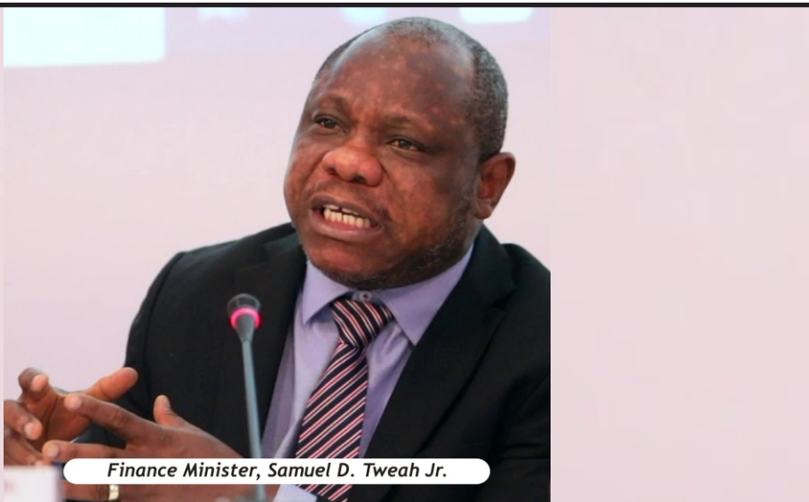
Finance Minister, Samuel D. Tweah Jr.

comme une initiative prioritaire, le gouvernement du Libéria a souligné son potentiel pour stimuler la croissance économique et améliorer les réseaux d'infrastructures essentiels à