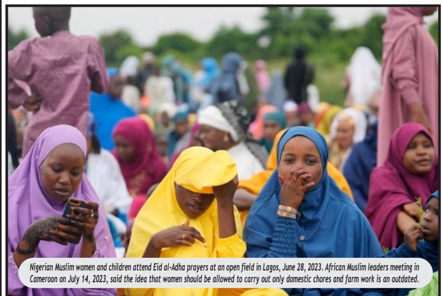
Nigerian Muslim women and children attend Eid al-Adha prayers at an open field in Lagos, June 28, 2023. African Muslim leaders meeting in Cameroon on July 14, 2023, said the idea that women should be allowed to carry out only domestic chores and farm work is an outdated.