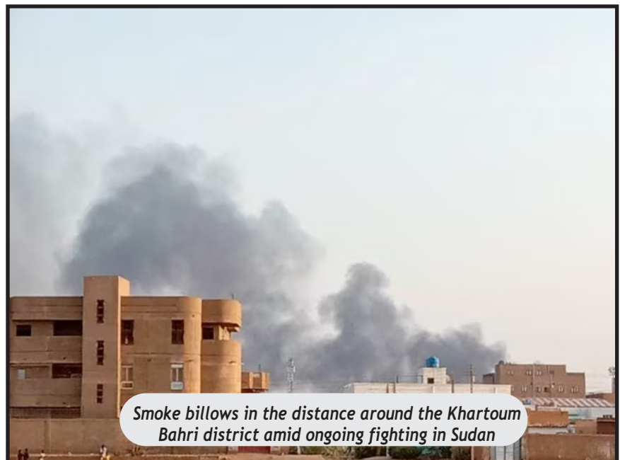
Smoke billows in the distance around the Khartoum Bahri district amid ongoing fighting in Sudan

The court's chief prosecutor has launched a new investigation into suspected war crimes in the current fighting, including sexual violence and civilians being targeted for their ethnicity. VOA