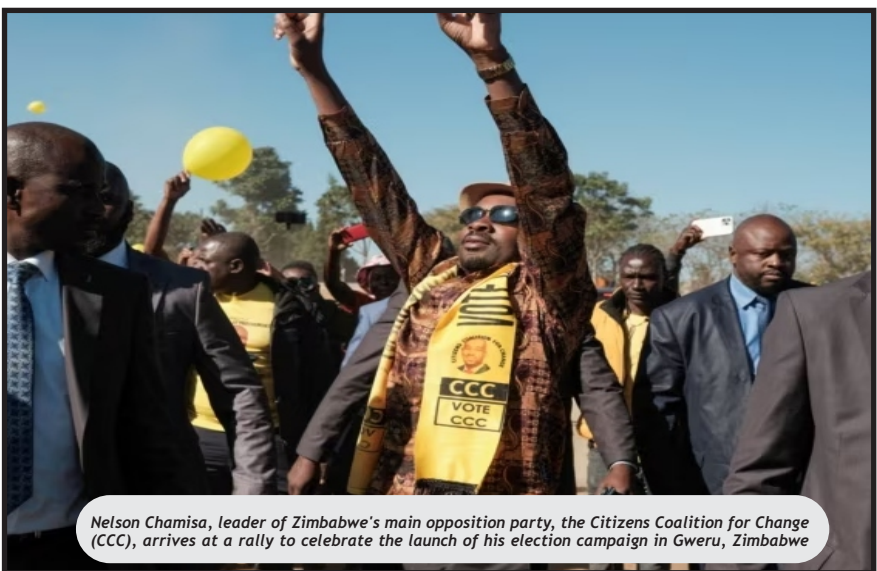
Nelson Chamisa, leader of Zimbabwe's main opposition party, the Citizens Coalition for Change (CCC), arrives at a rally to celebrate the launch of his election campaign in Gweru, Zimbabwe

Chamisa lamented the lack of development in the country, saying there was little to show after 43 years of democracy. "All we see is poverty,