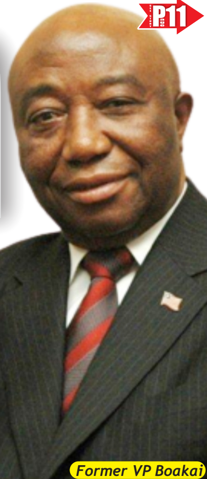
Former VP Boakai