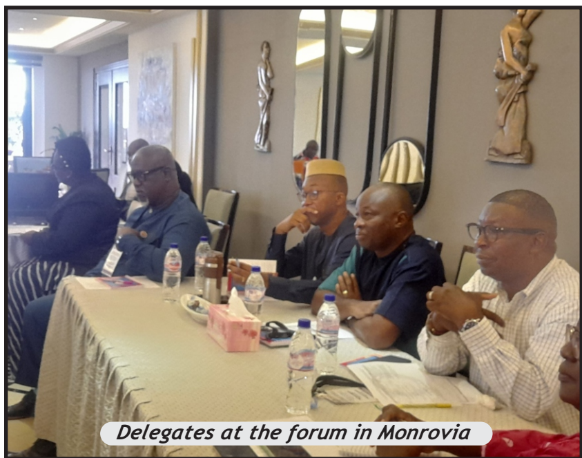
Delegates at the forum in Monrovia