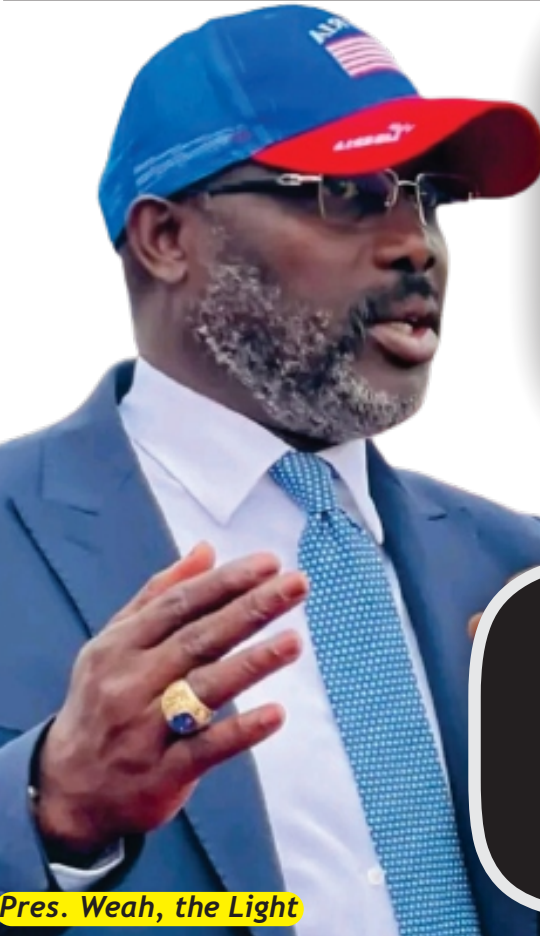
Pres. Weah, the Light

VOL. 13 NO. 123 WEDNESDAY, JULY 19, 2023 PRICE LD$40.00