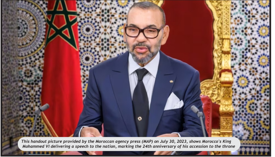
This handout picture provided by the Moroccan agency press (MAP) on July 30, 2023, shows Morocco's King Mohammed VI delivering a speech to the nation, marking the 24th anniversary of his accession to the throne

The king calls annually for a rapprochement with Algeria. VOA