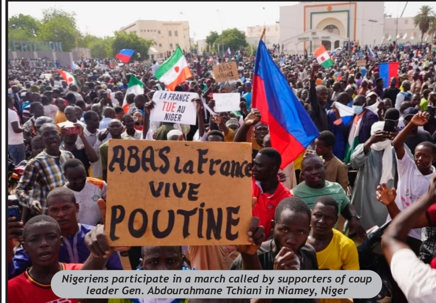
Nigeriens participate in a march called by supporters of coup leader Gen. Abdourahmane Tchiani in Niamey, Niger

"Everybody is wondering: why this coup? That's because no one was expecting it. We couldn't expect a coup in Niger because there's no social, political or security situation that would