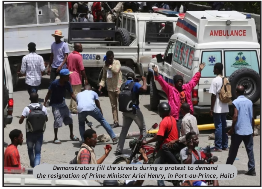
Demonstrators fill the streets during a protest to demand the resignation of Prime Minister Ariel Henry, in Port-au-Prince, Haiti

The council has asked Guterres to present by mid-August a report on all possible options, including a U.N.-led mission. Earlier this month, Blinken said the U.S. remained active in its search for a country to head a multinational force in Haiti. VOA