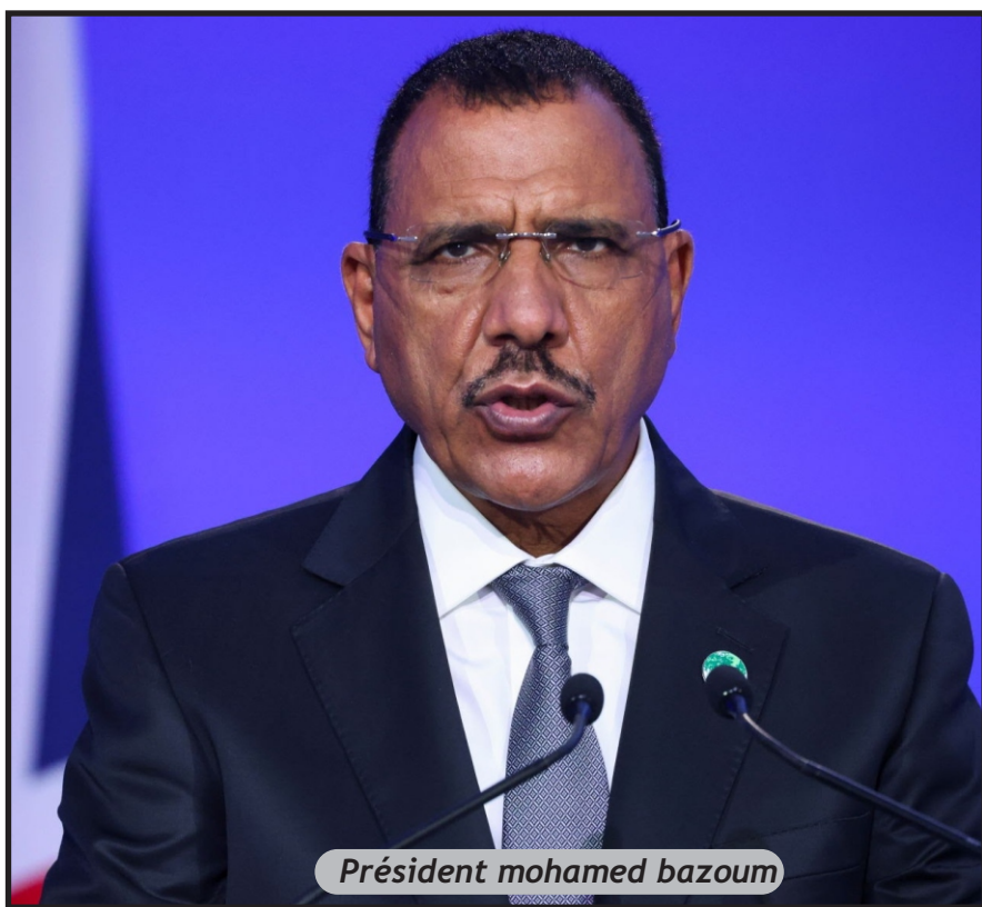
Président mohamed bazoum