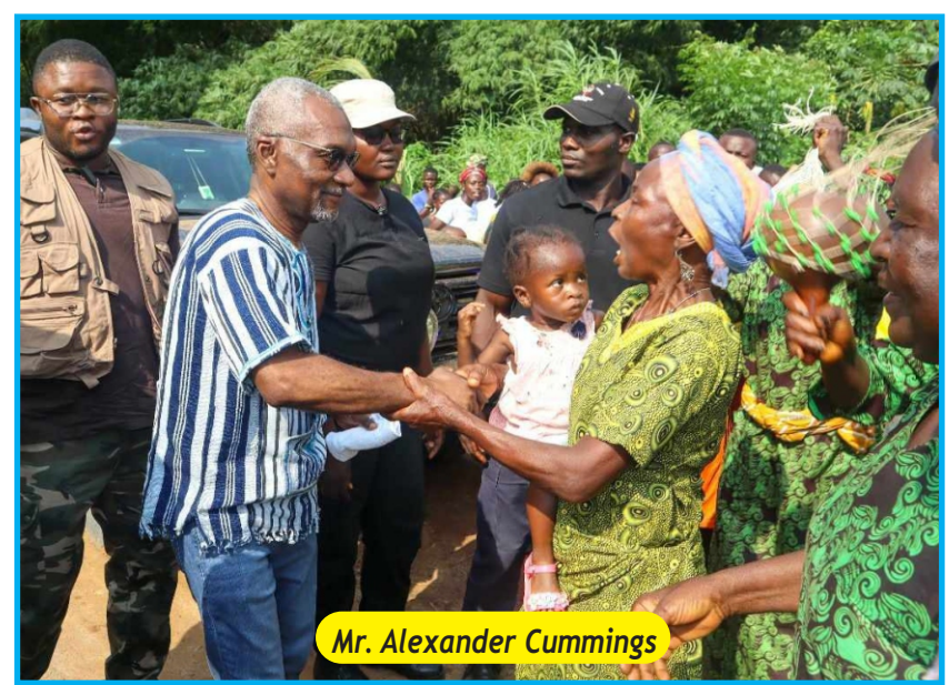
Mr. Alexander Cummings

The program was attended by a cross-section of citizens including chiefs, elders, youth and women groups, as well as local authorities, who expressed gratitude to the CPP Standard Bearer for his continuous assistance and always accepting their invitation to visit with them in Goghen Town. The citizens lamented the deplorable road conditions, poor health care delivery service, and their limited self-help initiative to renovate and improve the only elementary school in Goghen Town, Mana Clan, Bomi County. Cummings later empathized with the plight of the citizens and assured them that upon his ascendancy as President come October 10, Liberians will begin to experience systematic change in their living conditions. He said public resources will be used to address critical needs, that will bring maximum benefits and relief to the Liberian people, including road connectivity, improved health care delivery service, and a quality education system.