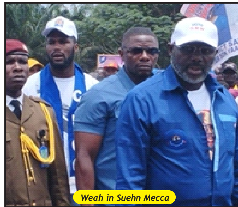
Weah in Suehn Mecca

Citizens of Bomi and Gbarpolu Counties, particularly those in Suehn Mecca District, Gbah, Bopolu, Gbarma and Kongba achievements as the people in Suehn Mecca and Gbah Districts. First-time voters, political leaders, and aspirants