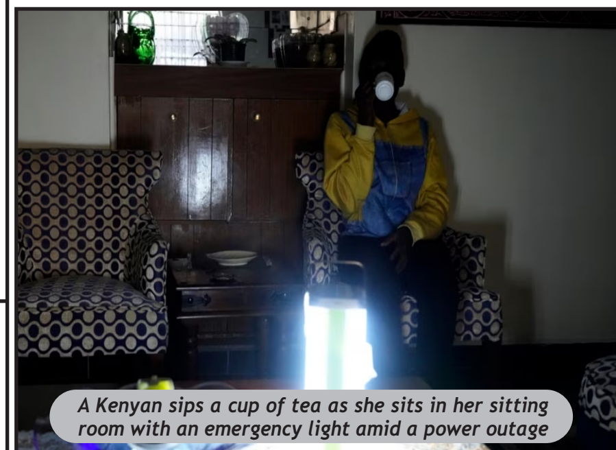
A Kenyan sips a cup of tea as she sits in her sitting room with an emergency light amid a power outage

President William Ruto, whose own office told The Associated Press on Saturday it was still running on generator power hours after Kenya Power announced it had restored electricity to "critical areas" of the capital, did not comment publicly on the crisis. Instead, he again criticized opposition calls for anti-government protests over the rising cost of living, calling them a