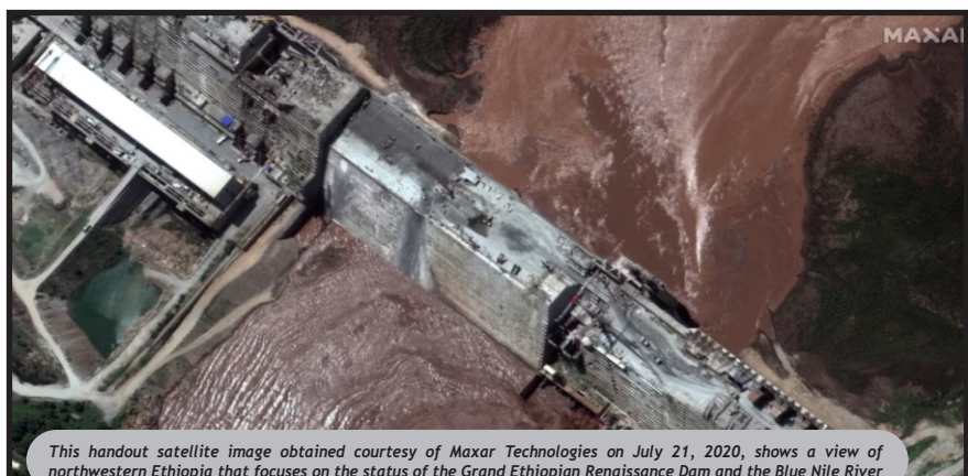
This handout satellite image obtained courtesy of Maxar Technologies on July 21, 2020, shows a view of northwestern Ethiopia that focuses on the status of the Grand Ethiopian Renaissance Dam and the Blue Nile River

between Cairo and Addis Ababa after the Ethiopian government began filling the dam's reservoir before reaching an agreement. Key questions remain about how much water Ethiopia will release downstream if a multi-year drought occurs and how the three countries will resolve any future disputes. Ethiopia has rejected binding arbitration at the final stage of the project. VOA