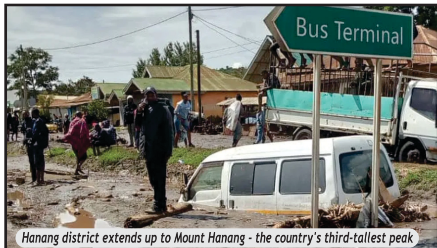
Hanang district extends up to Mount Hanang - the country's third-tallest peak

Crops in some parts of the country have been washed away, affecting people's livelihoods. Tanzania's meteorology agency has warned that the rains will continue this month. BBC