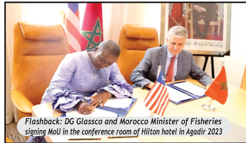
Flashback: DG Glassco and Morocco Minister of Fisheries signing MoU in the conference room of Hilton hotel in Agadir 2023

"I must emphasize the crucial role of community-led monitoring in improving community leadership for HIV. It is important to recognize that effective community leadership