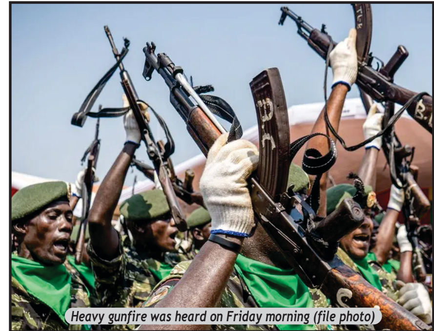
Heavy gunfire was heard on Friday morning (file photo)