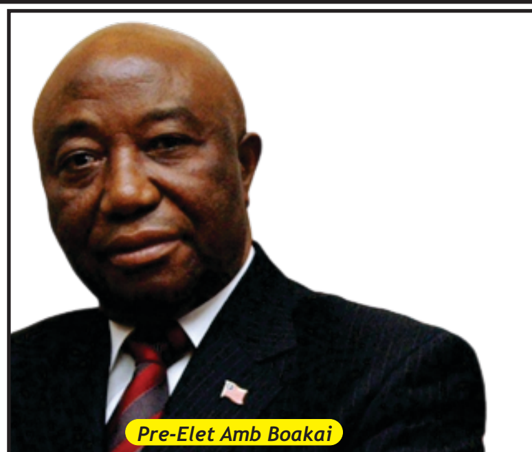
Pre-Elet Amb Boakai

Les détails émergents de la réunion du dimanche 7 janvier 2024 entre le président élu, Joseph N. Boakai, et le vice-président de la Chambre, Me Fonati Koffa, font état d'une tentative infructueuse de Boakai de faire pression sur Koffa pour qu'il se retire de la course à la présidence de la Chambre des Représentants, à seulement quelques jours des élections à la chambre basse, a appris le New Dawn. Me Koffa, actuel vice-président de la 54e Assemblée législative, cherche à remplacer son supérieur, le président sortant Bhofal Chambers. Cependant, la réunion entre Boakai et Koffa ne s'est pas bien déroulée le dimanche. Le président élu aurait demandé au vice-président Koffa de se retirer de la course à la présidence de la Chambre des Représentants pour ouvrir la voie au candidat du Parti de l'Unité, le représentant Richard N. Koon, qui se présente également à la présidence de la Chambre, mais celui-ci aurait refusé.