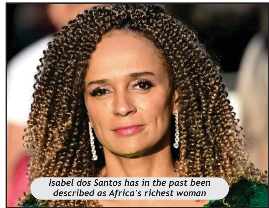
Isabel dos Santos has in the past been described as Africa's richest woman

Fresh criminal charges against Angolan billionaire Isabel dos Santos are politically motivated, a lawyer for the businesswoman has said.