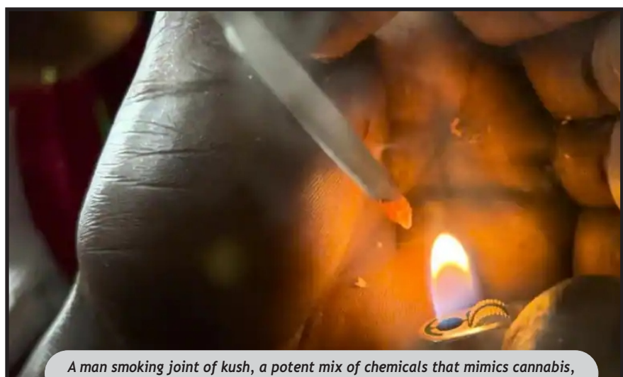
in a shack where people smoke the drug in Sierra Leone on July 21, 2023

Kush— a mixture of chemical Alieu, head of a police synthetic drug kush, two weeks substances with similar effects to transnational organized crime after drug abuse was declared cannabis— has been prevalent in unit, during a short ceremony