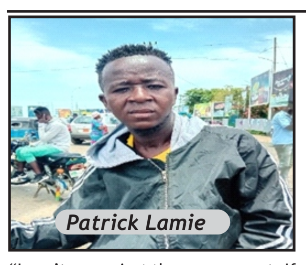
"I can't go against the government. If the government says motorbikes will

The Liberia National Police has announced restriction of commercial motorbikes from the main streets of Monrovia for public safety purposes. But commercial bike riders are unhappy about the restriction, as they explain to the NEW DAWN, Read their responses as compiled below.