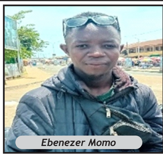
"The government talks about

you will realize that most of the accidents that occurred are from motorbikes. We want to save lives and property; we want to have a city where there is free-flow or such a very high security rate, so looking at the rescue mission and they want to redefine course of action for the traffic in Monrovia. So we support that motorbikes should be restricted, not coming in the main street of the city but stopping in some local areas, and move ahead with their daily journey in the traffic.