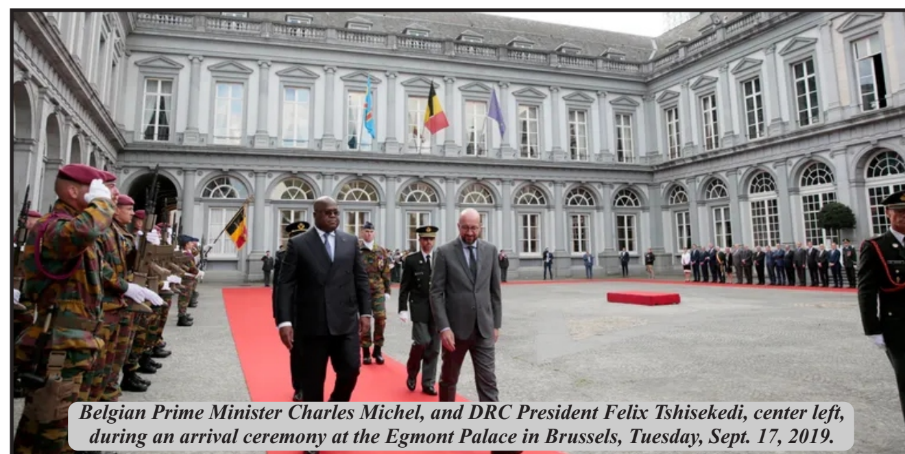
Belgian Prime Minister Charles Michel, and DRC President Felix Tshisekedi, center left, during an arrival ceremony at the Egmont Palace in Brussels, Tuesday, Sept. 17, 2019.