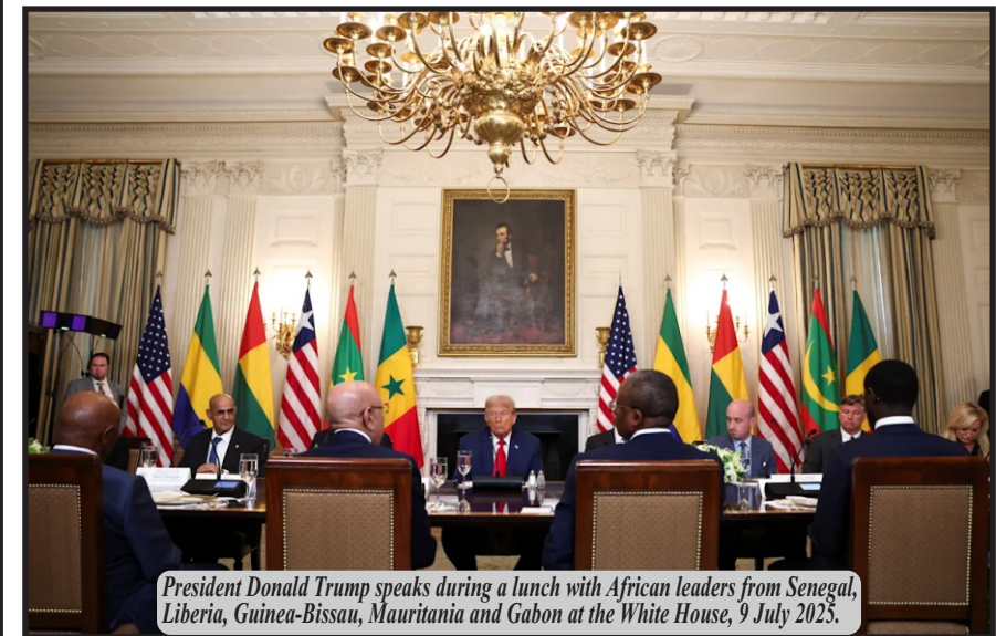
President Donald Trump speaks during a lunch with African leaders from Senegal, Liberia, Guinea-Bissau, Mauritania and Gabon at the White House, 9 July 2025.

However, this complaint is focused solely on those with Belgian nationality who can be prosecuted in our legal system. "Further charges may soon be filed in other countries where the looters of our resources are from," one of the prosecutors remarked.