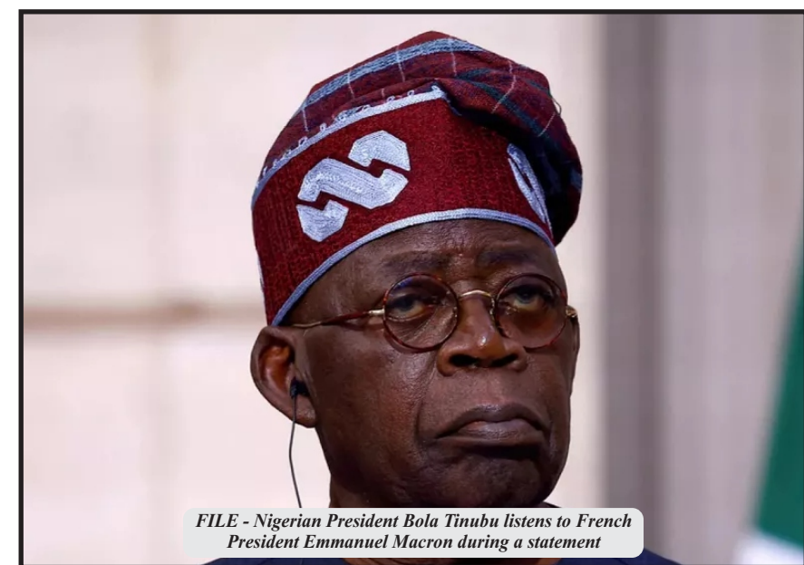
FILE - Nigerian President Bola Tinubu listens to French President Emmanuel Macron during a statement

But he only made good on that commitment by visiting Angola in December 2024, just weeks before he left office.