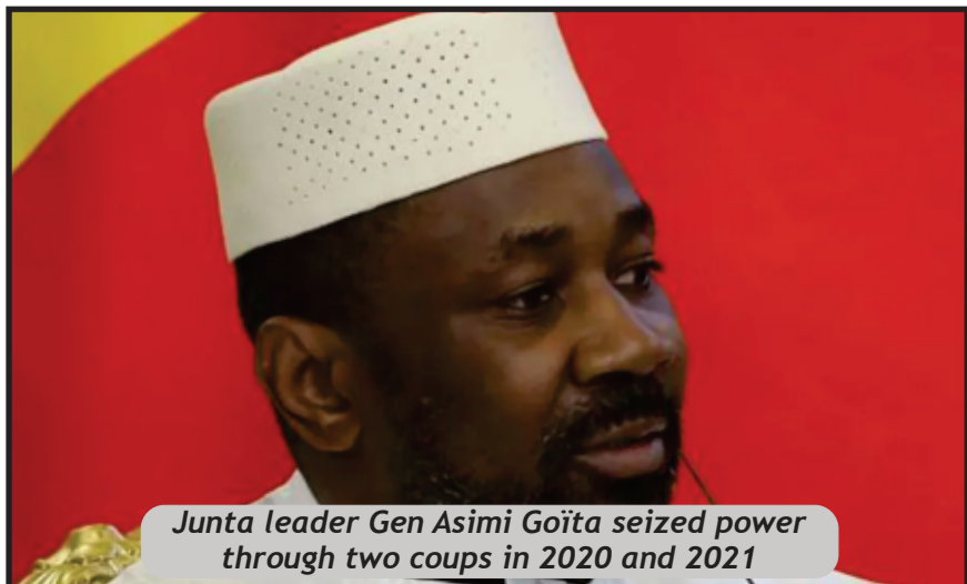
Junta leader Gen Asimi Goita seized power through two coups in 2020 and 2021

They come amid political tension heightened by the junta's crackdown on former Prime Ministers Moussa Mara and Choguel Maiga over accusations of harming the reputation of the state and embezzlement. Mara, a recent outspoken critic of the military government, has been in detention since 1 August, while Maiga is facing judicial sanctions.